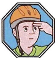
POSITION THE HELMET