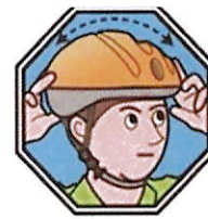
TEST THE FIT