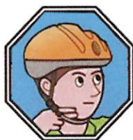
ADJUST THE CHIN STRAP