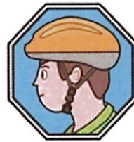
ADJUST OTHER STRAPS